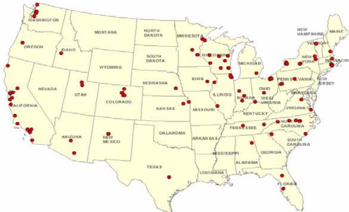
Figure 1. Colleges and Universities with U-Pass, Transit Discount or Fare-Free Transit Programs in the Conterminous United States 21

Other colleges and universities augment local transit service by providing private, university-run shuttle buses. A